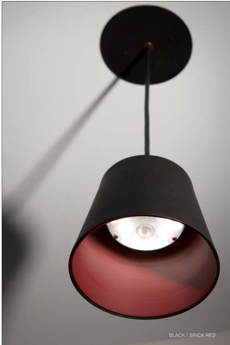
BLACK / BRICK RED