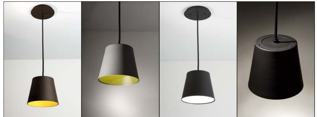
BRONZE / YELLOW