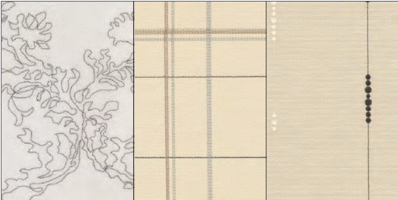
SIHLOUETTE 6721 813