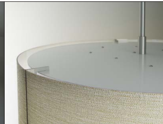
TOP DETAIL 6619-92 QUARRY