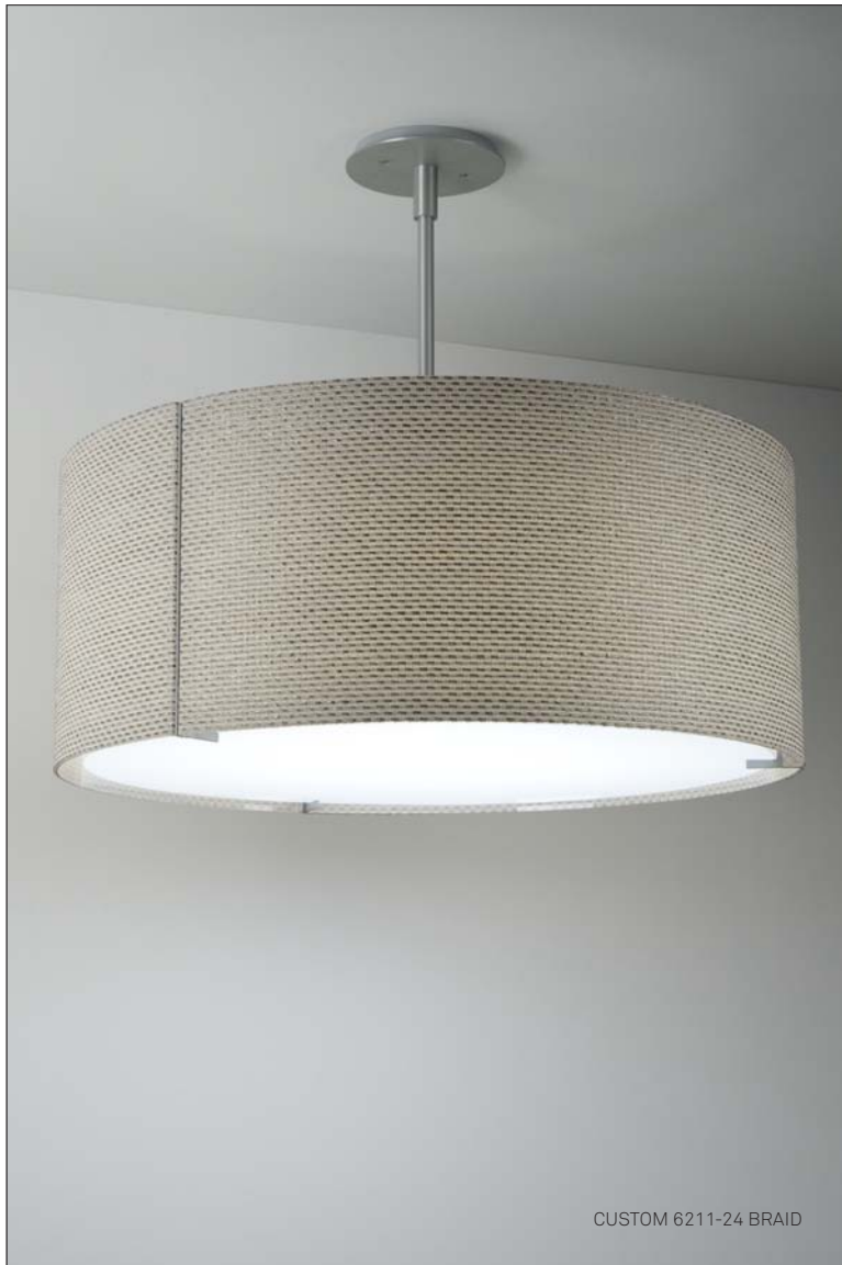
CUSTOM 6211-24 BRAID