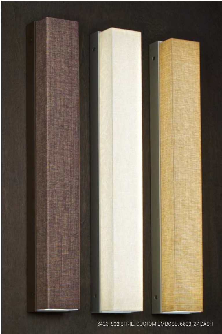
6423-802 STRIE, CUSTOM EMOSS, 6603-27 DASH