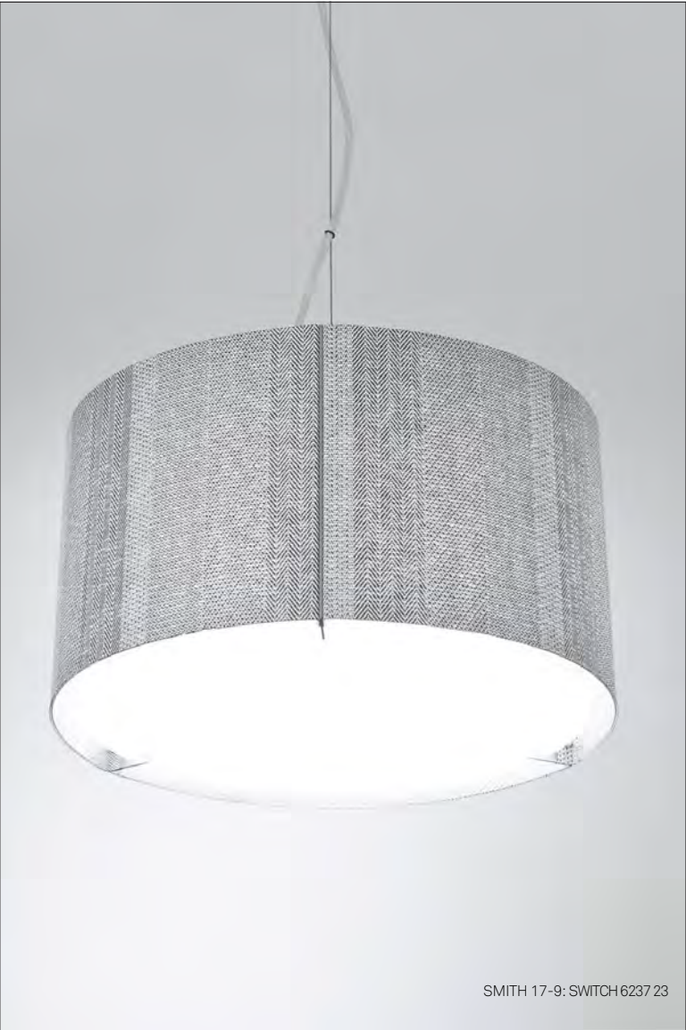
SMITH 17-9: SWITCH 6237 23

UTILIZED ON: NARA, SMITH, SAVOYE, BOX, PUNCHEON, BALLARD, CROWN HILL, D-LIGHTS