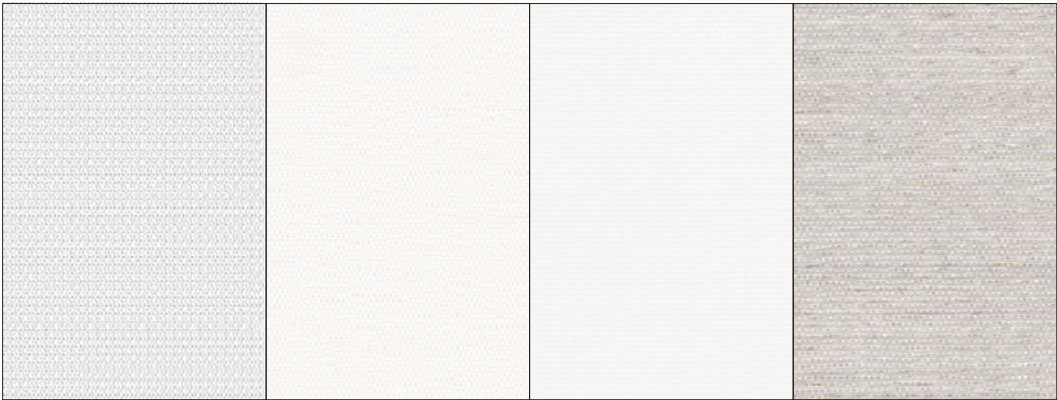
PRISM 6621 160

UTILIZED ON: MOSQUITO, MOSQUITO SUPERLIGHT, AND NARA