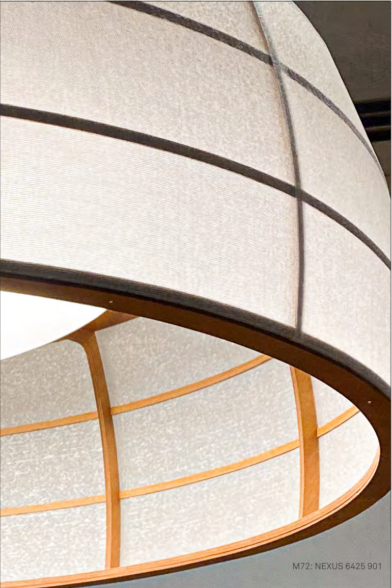
M72: NEXUS 6425 901

UTILIZED ON: MOSQUITO, MOSQUITO SUPERLIGHT, AND NARA